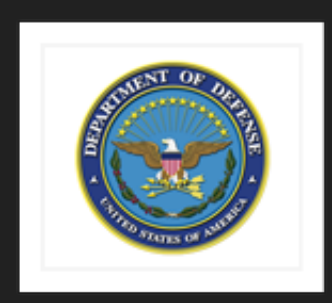
United States Department of Defense (DoD)