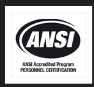
American National Standards Institute (ANSI)