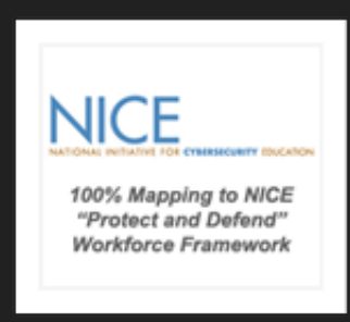
The National Initiative for Cybersecurity Education (NICE)